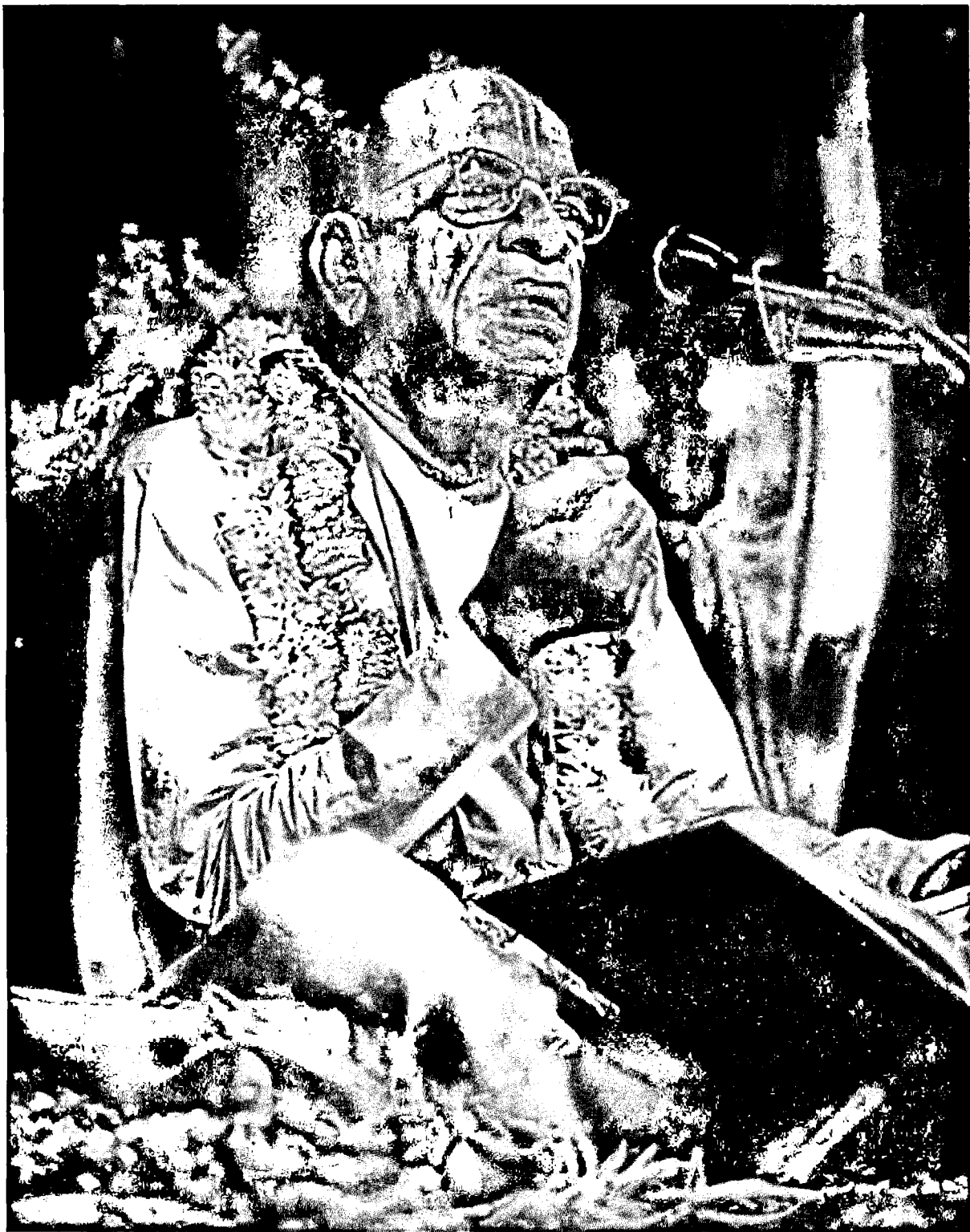
Sri Srimad A.C. Bhaktivedanta Swami