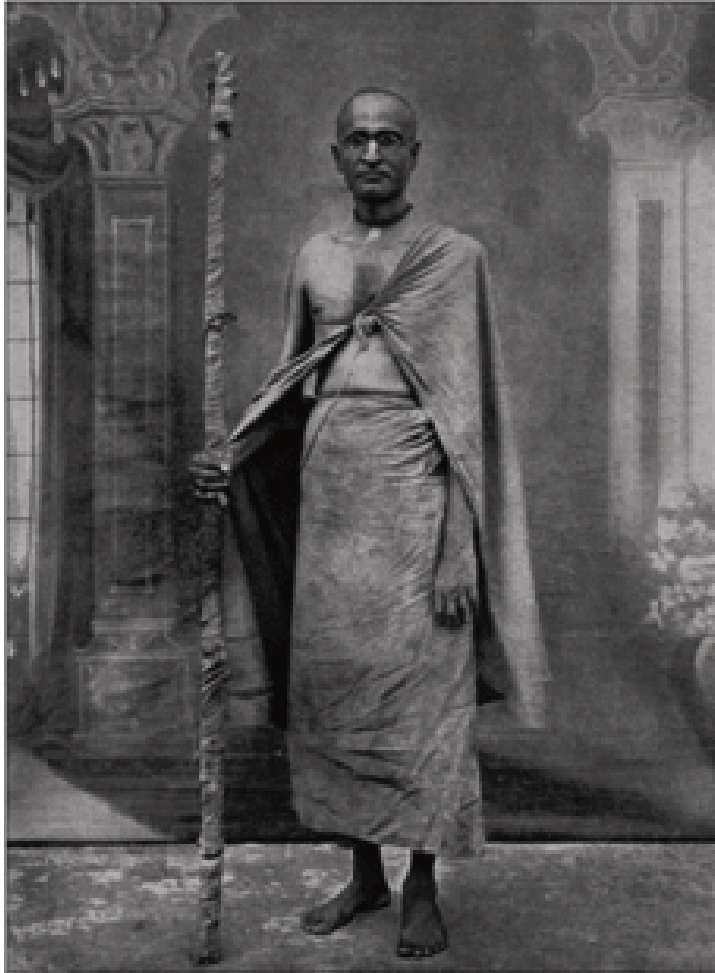
His Divine Grace Bhaktisiddhanta Sarasvati Thakura Prabhupada