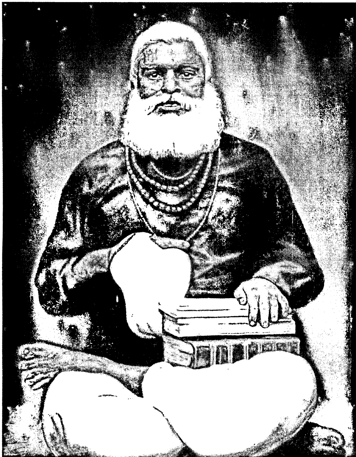
Sri Srimad Sachidananda Thakur Bhaktivinode